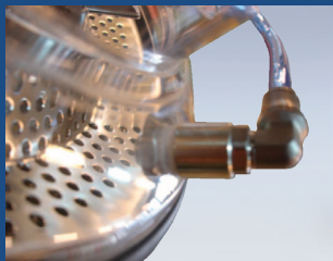
Dust agitation system for optimum dedusting