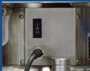
Simple control over dip-switch