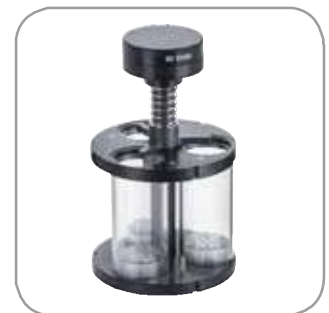
Special testing basket for large tablets