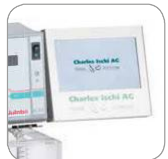
The DISI-A Touch is operated via the touchscreen